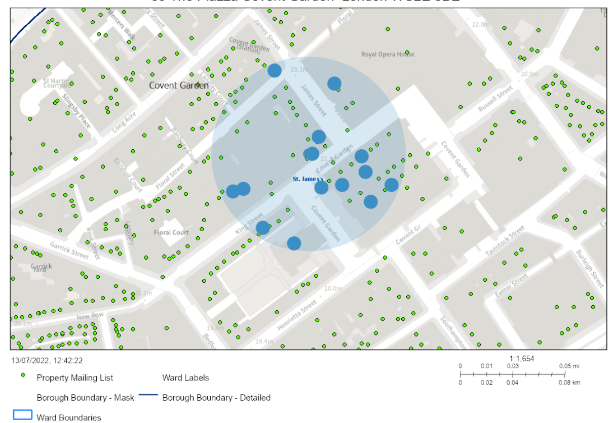
35 The Piazza Covent Garden London WC2E 8BE